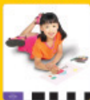
People in Action (verbs)

Look for these additional Smart Talk card sets: