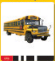
Tools and Vehicles