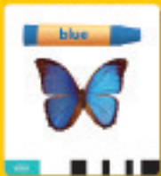
Colors and Shapes